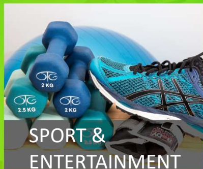
SPORT & ENTERTAINMENT