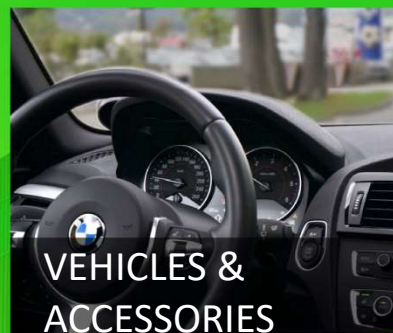
VEHICLES & ACCESSORIES