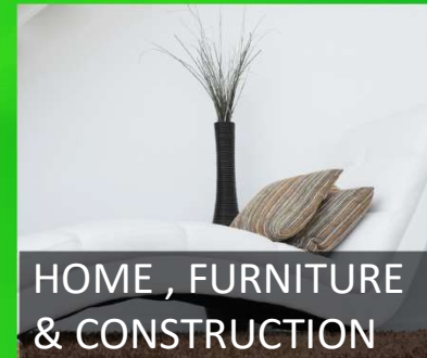
HOME , FURNITURE & CONSTRUCTION