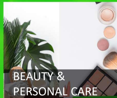
BEAUTY & PERSONAL CARE