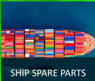
SHIP SPARE PARTS